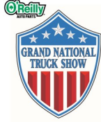
Exhibit Space Agreement:

Deadline for Requesting/Early Space is June 1, 2025