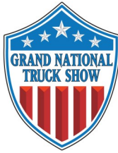
Exhibit Space Agreement:

Please accept my Commercial Exhibitor contract for the Grand National Truck Show. My firm's requirements are as follows: